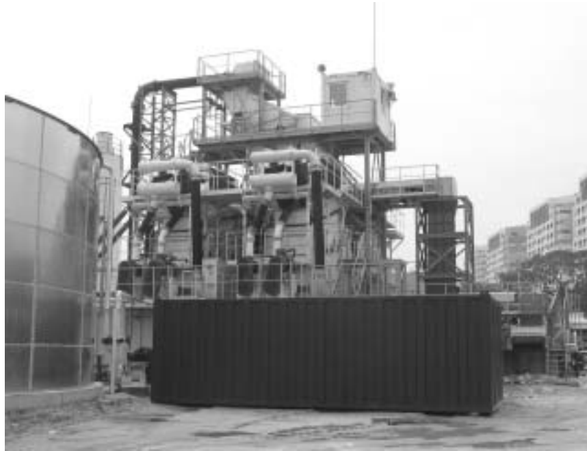
Figure 5.1 Surface installation of an STM slurry treatment plant

undertake investigations such as boreholes as close to the planned alignment as desired or at the preferred frequency. The result may be compromised data quality and greater uncertainty in the excavation phase.